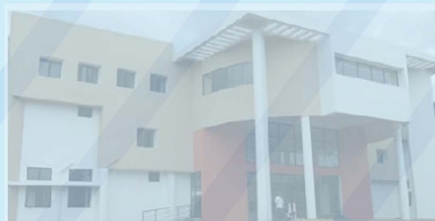
College of Engineering, Pathanapuram