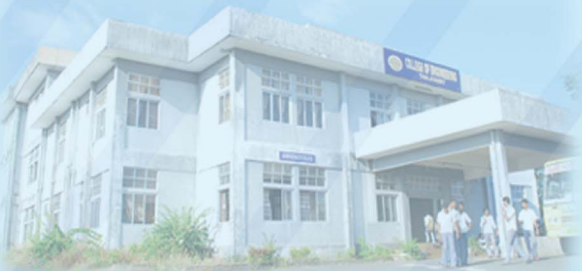
College of Engineering, Thalassery