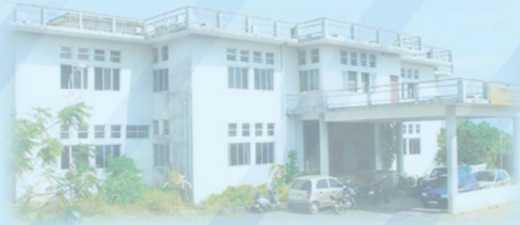
Co-operative Institute of Technology, Vadakara