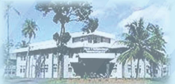
College of Engineering, Perumon