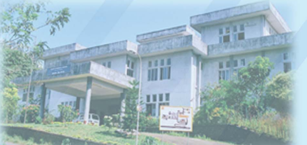
College of Engineering, Kidangoor