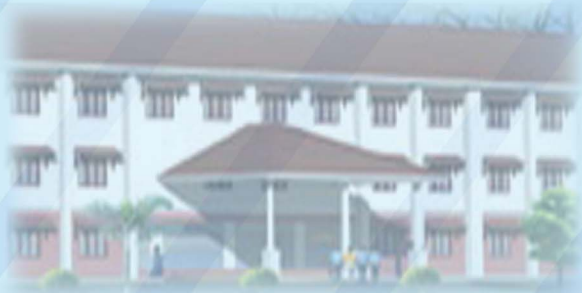
College of Engineering & Management, Punnappra