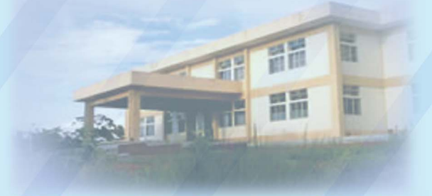
College of Engineering, Trikaripur